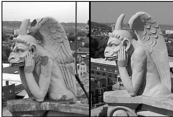
Figure 7: Terra Cotta gargoyle, before and after repair with Custom System 45 and coating with Elastowall 351 .

Both products are available in over 900 standard colors, which can be prepared in-house by Edison Dealers who participate in the Edison Coatings Tint Base program. Custom color matching service is also available from Edison Coatings, Inc.