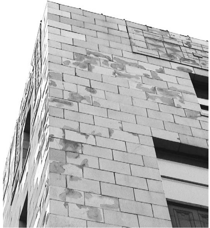
Figure 2: Thin-Section glaze spalls are common in terra cotta subjected to bulk moisture infiltration.

after initial set to produce fluted profiles, when required to match existing terra cotta.