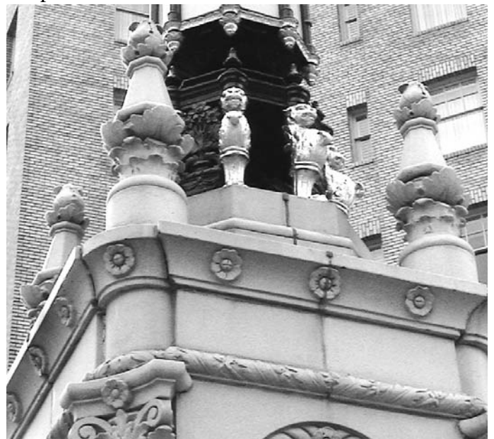
Figure 1: Replacement finial (right) was cast with custom color-matched Custom System 45 using Restoration Latex RL-2 .

After proper surface preparation, repairs to spalls greater than 1/8" (3 mm) in depth are best achieved using Custom System 45 TC grade. A two component cementitious system, Custom System 45 provides higher bond strength, lower shrinkage and more efficient stress relief than competitive systems. This allows installation of large and deep repairs without cracking, special curing regimens or distress to historic substrates. Low coefficient of thermal expansion ( <4 \times 10^{-6} in/in/ ^{\circ} F) assures long term thermal compatibility with fired clay substrates, even in areas subject to rapid, wide swings in ambient temperatures.