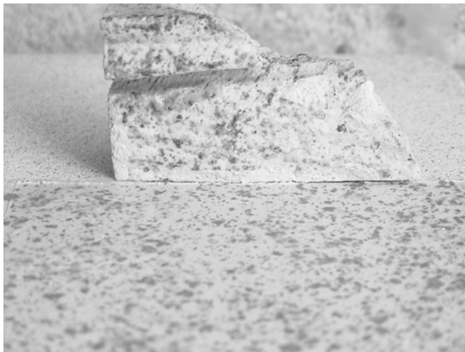
Figure 8: Terra Cotta fragment sits atop a precast concrete panel which has been base-coated with light grey Aquathane UA210 NCL and top-coated with AquaSpex 220 , incorporating 1500 micron Charcoal Grey flakes. The combination provides a final finish which closely matches the original material.

In addition, AquaSpex 220 may be used to provide speckles of specific size, concentration and color. AquaSpex 220 incorporates color-matched flakes in a clear binder, permitting close control of speckle color, density and size.