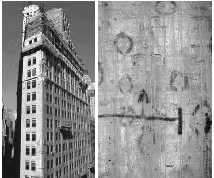
Figure 3 (left): Pump-X53 was used to fill voids between terra cotta band courses and rubble masonry backup on this project in New York City. Figure 4 (right): Injection points are marked on an interior wall surface; Pump-X53i was injected through the back-up wall into the masonry exterior veneer to fill cracks and voids in the stonework.

Both two-component, 100% solids acrylate-epoxy adhesives can be used under a wide range of temperatures to quickly grab and re-bond all types of broken masonry elements. Variable mix ratio allows users to adjust working times and consistencies under varying working conditions.