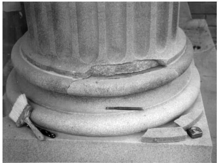
Figure 5: Stone column base, before and after rebonding with Flexi-Weld 520T .