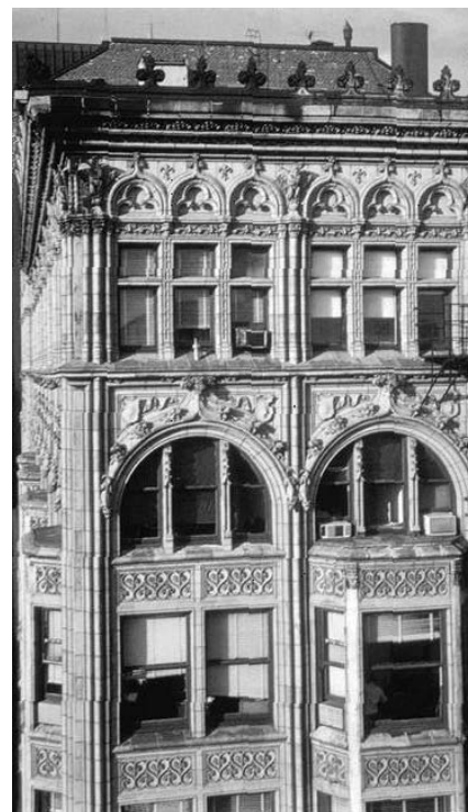
PHOTO: Repointing of Chicago's Historic Landmark Fisher Building with SPEC-JOINT 46 continued through severe winter conditions with the use of a proprietary non-chloride admixture approved by Edison Coatings, Inc.

A. Remove excess mortar and smears using a stiff natural bristle brush and water before it has set