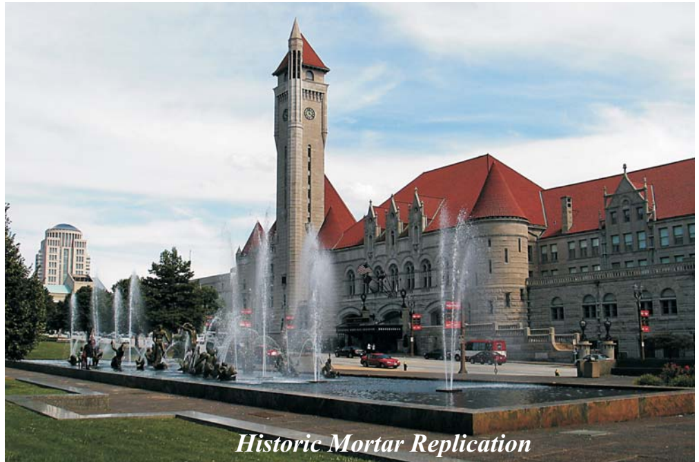
Historic Mortar Replication

Repointing of the Historic Union Station in St. Louis was performed using a custom formulated Spec Joint 46 to match appearance and composition of the original 1896 mortar.