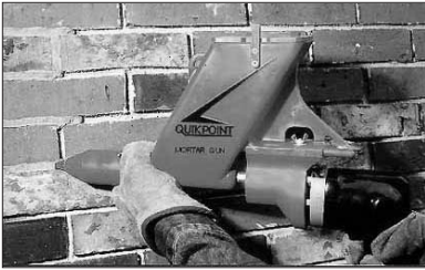
PHOTO: SPEC-JOINT 46 can be used in electric pointing guns without special admixtures or mix modification.